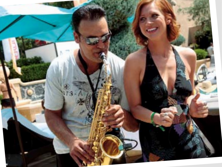
Actress Brittany Snow enjoys the atmosphere

Open daily, 11am-6pm, for guests aged 21 or over. Please call 702 767 3724 or see www. palazzo.com/azure for cabana, daybed and lounge chair reservations.